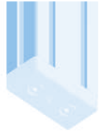
Transport- und Fußplatte 45 × 90 Transport and Base Plate 45 × 90